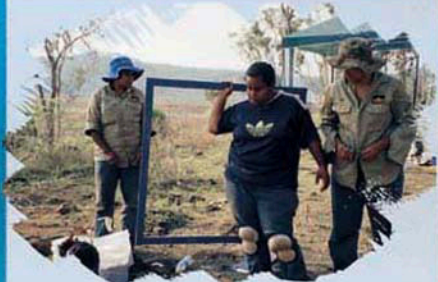
Stage 2 commenced in June 2001.